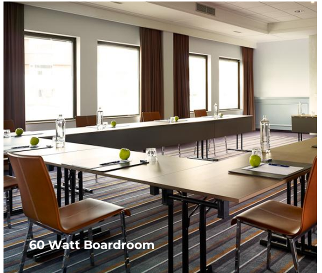
60 Watt Boardroom